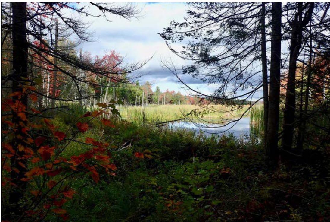
View from Station #2 (Cattail Marsh) in Northeast Penjajawoc Preserve.

This space we call a cattail marsh is made up of about 50% open water and 50% cattails, sedges, arrowhead, pickerelweed, and other plants. These plants provide food for muskrats and beavers, as well as food for ducks and other birds. These plants also offer protective nesting areas for Least Bitterns, wrens, and American Coots. All of this is undergirded by bedrock, glacial marine silt and till, and topped off with muck...glorious muck. No, muck is not just a brand of boots, it's also an important soil type. The black, granular, water-saturated, muddy stuff is rich in organic matter coming from decomposed plants, plankton, and other micro-creatures. Muck is an important component of what makes a marsh a marsh. Marshes are incredible, complex places that include grasslands that are a transition zone between the aquatic and terrestrial spaces. These, too, are valuable to wildlife. Collectively, the marsh complex supports great biological diversity. Thus we come full circle. Next time you are at Northeast Penjajawoc Preserve check out the marsh. It's a remarkable composite of life.