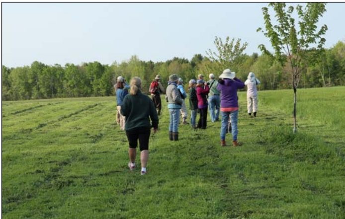
Neighborhood Bird Walk at West Penjajawoc Grasslands

MAINE AUDUBON AND FIELDS POND AUDUBON CENTER: Maine Audubon, centered in Falmouth, owns about half of West Penjajawoc Grasslands Preserve, and allows Bangor Land Trust to manage their land along with ours. Fields Pond Audubon Center in Holden co-sponsors bird walks every spring with Bangor Land Trust, along with additional occasional nature programs