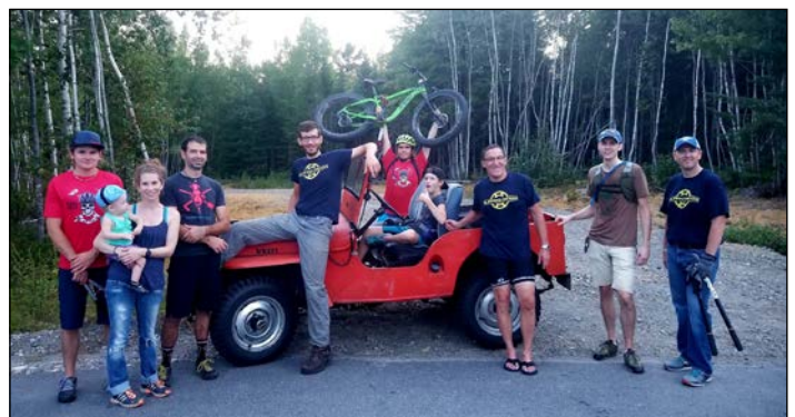
Local NEMBA trail work crew

PENOBSCOT REGION NEMBA: Our local mountain biking organization put their Wednesday Night Trail Grind energies to work to construct two low bridges over some seasonally very wet trail and help clear brush that was cut to widen and dry out Walden-Parke's Blue Jay Trail.