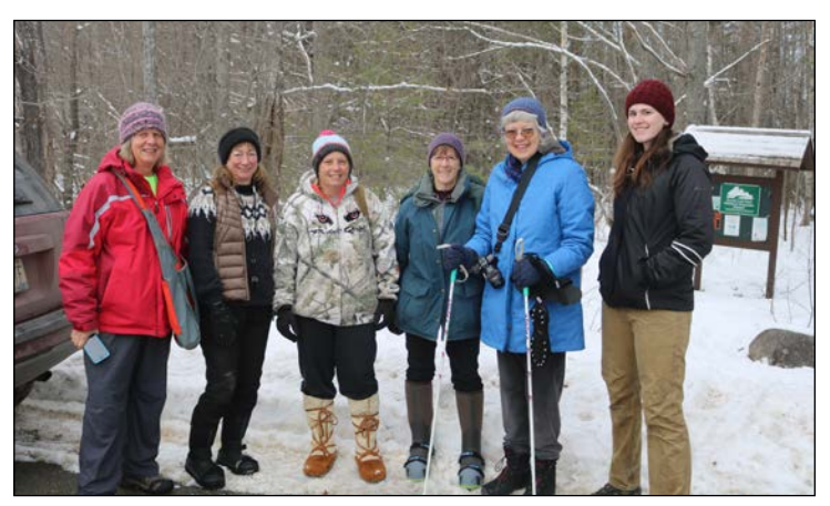
Mammal Tracks & Signs program, January 20, 2018

For more information or to RSVP call 942-1010 or email info@bangorlandtrust.org