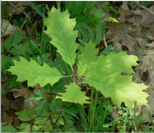
Northern Red Oak