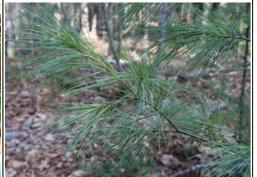
Eastern White Pine